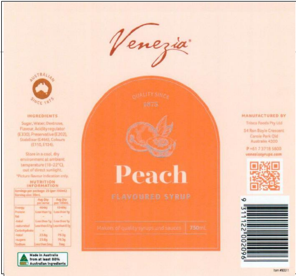
Bottle Label (x1)

PACKAGING SPECIFICATION VENEZIA PEACH FLAVOURED SYRUP 6 x 750 mL CODE: 90511