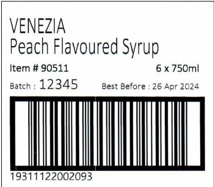
Bartender Sample Carton Label (x2) (Use only if Print & Apply system is offline) (A carton label showing an updated batch number and best before date)