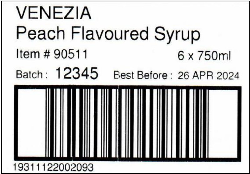
Print & Apply Sample Carton Label (x2) (A carton label showing an updated batch number and best before date)