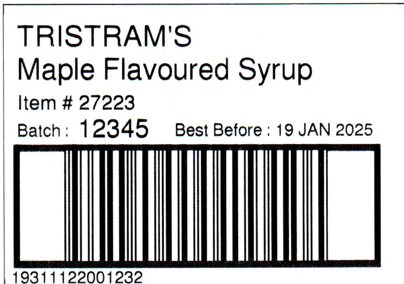
Print & Apply Sample Carton Label (x2) (A carton label showing an updated batch number and best before date)