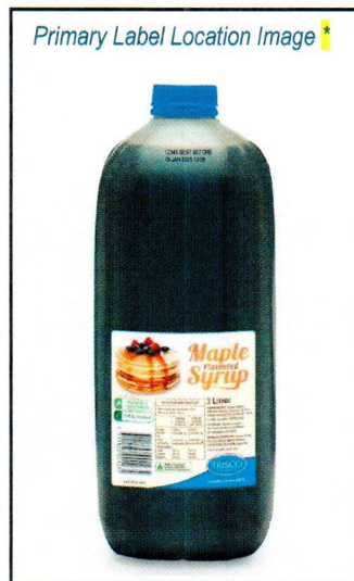
* Label placed 35mm from bottom of bottle