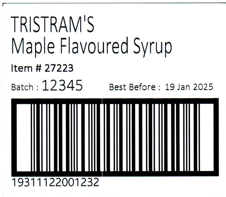
Bartender Sample Carton Label (x2) (Use only if Print & Apply system is offline) (A carton label showing an updated batch number and best before date)