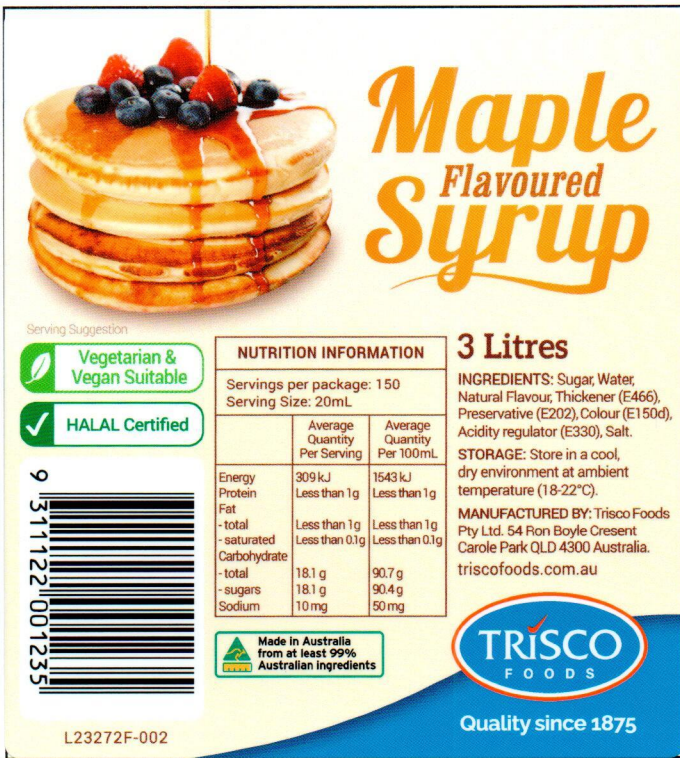
Bottle Label (x1)