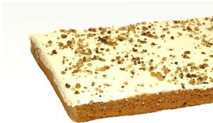
5305 Carrot Tray Cake- With Border 2.4kg

Storage & Handling Conditions: Keep refrigerated at or below 5° C. Frozen at/or below -15° C.