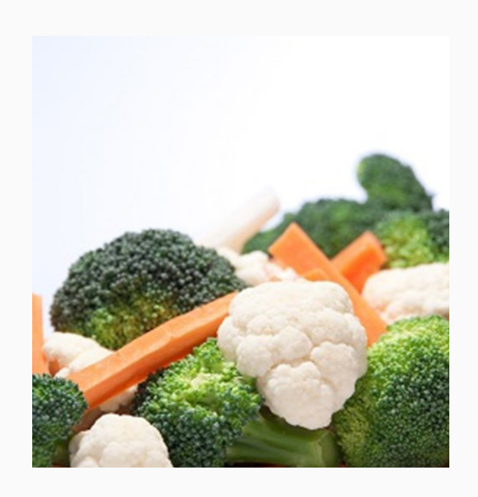
Certifications: HACCP Certified.

Cafes, restaurants, QSR, clubs, hotels, catering, hospitals, canteens and institutions.